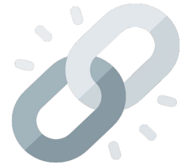
Coaching Into Connection (ACMF)