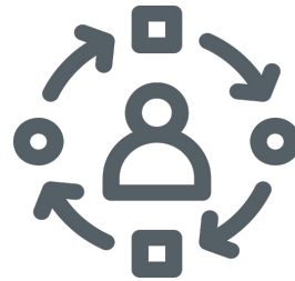
High Acuity Care Transition Team (ACMF)